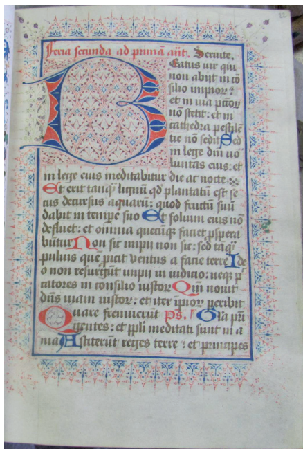
Fig. 3. MS Tournai, Séminair de Tournai, LM 9, f. 22r

The other manuscript which can be linked to Jericho at the moment is preserved in the Dutch Royal Library in The Hague under shelfmark 70 E 6 70 . This Latin convolute contains a collection of sermons with glosses (ff. 1r-445v) and a world chronicle (ff. 459r-558v). Based on the heading of the prologue to the world chronicle, the manuscript is dated in 1487 and located in Tienen (Tirlemont), located about eleven miles east from Louvain: