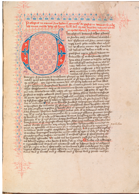
Fig. 4. Beginning of the World Chronicle from Tienen (MS The Hague, KB, 70 E 6, f. 459r)