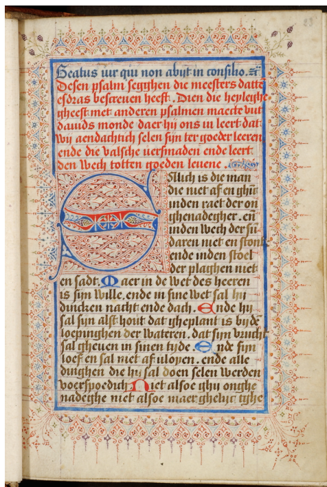
Fig. 2. Beginning of the Middle Dutch translation of the Psalms and Song of Songs (MS Brussels, KB, II 293, f. 23r)

In all probability, the sisters designed the manuscripts they sold in a similar way. Therefore, palaeographical research and especially the study of illumination may assign manuscripts which have been preserved in other convents to the scriptorium of Jericho, as can be illustrated by the following two examples.